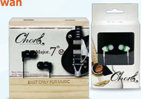
Product: Chord Earphone 產品: Chord 耳機