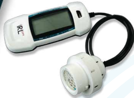
Product: Infrared & Laser Acupuncture Device 產品: 激光與紅外光子針灸儀

Providence Enterprise Limited 香港匯進企業有限公司 Contact 聯絡: cs@providencechina.com