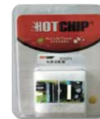
Product: Power Adapter IC-HT2262/HT2263, HT2269/2279 產品: 電源適配器