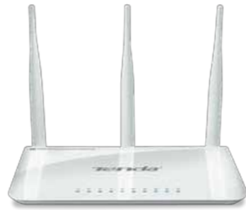
Product: Concurrent Dual Band Wireless N900 Gigabit Router 產品: 900M雙頻千兆無線路由器