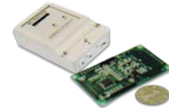
Product: Single Lamp Controller 產品: 單燈控制器