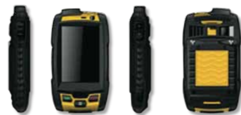
Product: RG210, Rugged IP68 Water & Dust proof Mobile Phone 產品: 堅固防水功能性智能手機