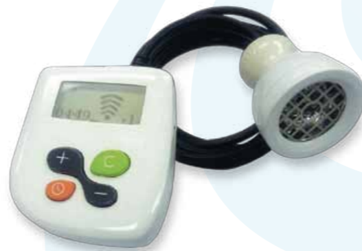
Product: Infrared Moxibustion Device 產品: 紅外光子灸療儀