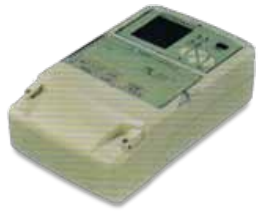
Product: Concentrator 產品: 集中器