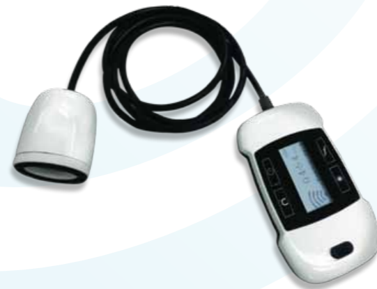
Product: Mini Infrared & Laser Acupuncture Device 產品: 迷你激光與紅外光子針灸儀

HKIA is a non-profit making organisation. Established in March 1996, it was invited to join International Federation of Inventors Association (IFIA) at the same year to promote invention activities internationally. HKIA is committed to advocating invention and innovation, protecting patent and intellectual property, assisting inventors to commercialise their inventions and promoting new technology development. 香港發明協會為非牟利社團，旨在提倡發明創新，保護發明專利，協助發明家與工商界合作，使發明商品化，促進科技發展。協會成立於1996年3月，同年獲邀入瑞士國際發明家聯盟組織 (IFIA)，共同推動國際發明創新活動。