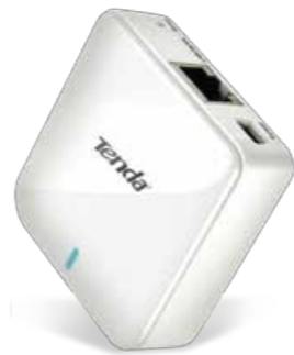
Product: Wireless N150 Mini AP/Router 產品: 便攜式150M MINI型無線路由器