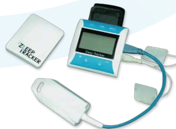
Product: Sleep Apnea & SPO2 Recorder 產品: 睡眠窒息及血氧記錄儀

City University of Hong Kong, Hong Kong 香港城市大學，香港