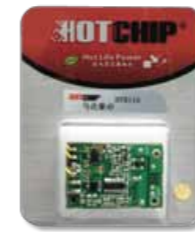
Product: Motor Drive IC-HT5115/HT5125 產品: 馬達驅動器