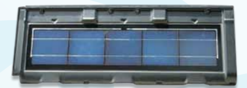
Product: Roof Tile Of Solar Power 產品: 安固太陽能光電瓦