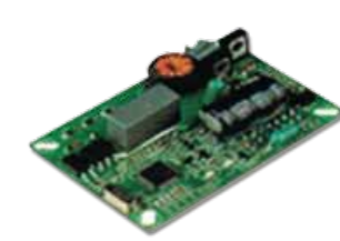
Product: Communication Module of PLC 產品: PLC通訊模塊