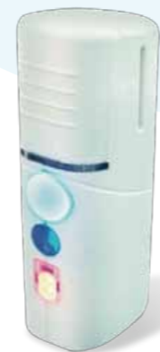
Product: Mist Dispenser 產品: 霧化美容儀

Hong Kong Invention Association Ltd. (HKIA), Hong Kong 香港發明協會，香港