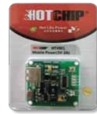
Product: Mobile Power IC-HT4901 產品: 移動電源