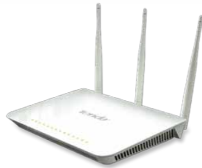
Product: Concurrent Dual Band 11ac 1750M Router 產品: 11ac 1750M雙頻千兆無線路由器