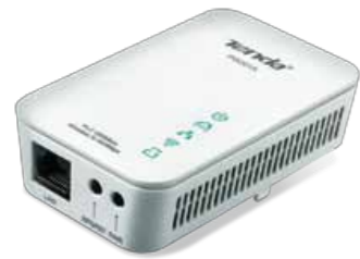
Product: Wireless N Powerline AP 產品: 300M電力線AP