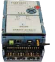
Product: Concentrator 產品: 集中器