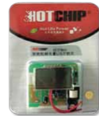
Product: Universal Charger IC-HT3786D 產品: 萬能充電器