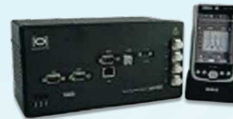
Product: Fiber Sensing Interrogation System 產品: 光纖感測系統