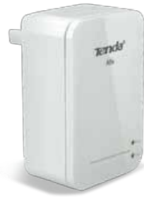
Product: Ultra-Portable Smart Router 產品: 150M便攜式智能無線路由器